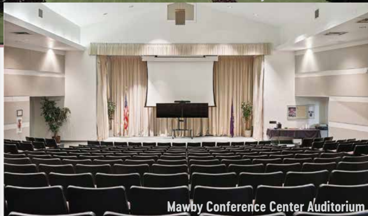
Mawby Conference Center Auditorium