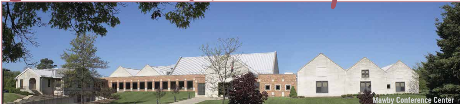
Mawby Conference Center

Many spaces, indoor and outdoor, on Starr Commonwealth's Albion Campus are now available to book for private events such as small conferences, large meetings, retreats, weddings, and more!****